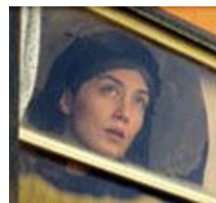
"Half Moon" Bahman Ghobadi